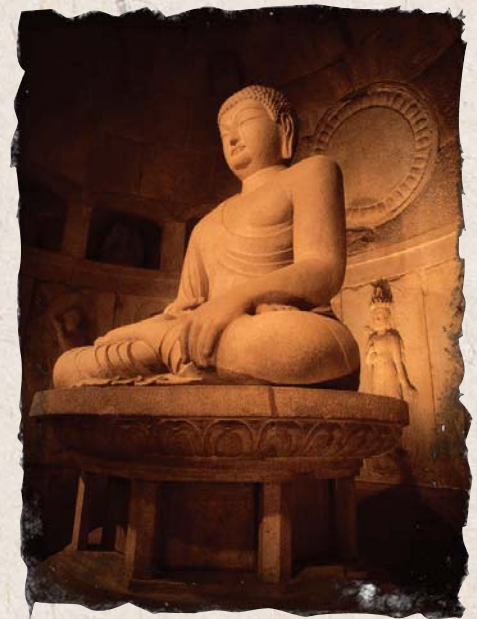
Gyeongju Sukguram Grotto