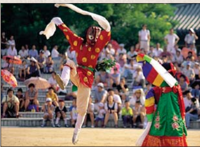
Andong Hahoe Folk Village

Korea, with its rich cultural heritages as well as its state of the art convention facilities and services, Korea has become a famous destination for international conventions and events. Korea has successfully hosted numerous international events and delegates from all over the world enjoyed the opportunity to discover Korea, a country with natural beauty, friendly people, and a 5,000-year cultural heritage.